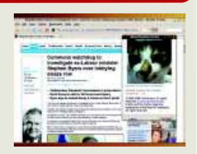
We couldn't resist juxtaposing this kitten with www.dailymail.co.uk.

in the About box with a random picture of a kitten. Get your kitten fix here! Destroy the Web We're pretty sure that this shouldn't be as much fun as it is. Destroy the Web temporarily turns any web page into a shoot 'em up game. Click on elements to destroy them (complete with explosion soundtrack!) and save your score at the end.