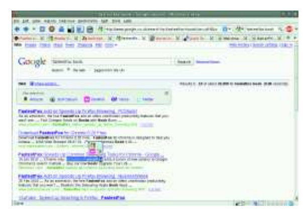
> FastestFox has a Also Search On box and the search/ Twitter widget is shown here next to the highlighted text.

Another neat feature is the small bubble widget that pops up if you highlight a section of a web page, giving you the option to tweet the selection, or to look it up on various services. By default, these are Wikipedia, Google, or OneRiot (which indexes links shared on Digg, Twitter, and other social