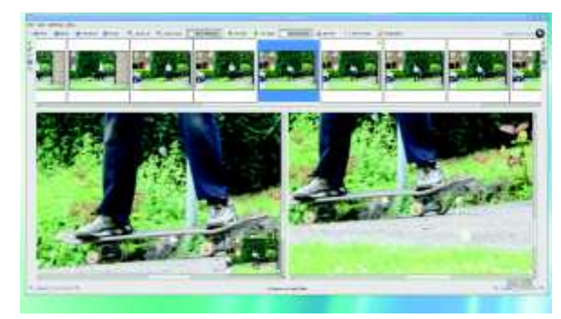
> The Light Table is a great way to compare a RAW image with its JPEG counterpart. You can synchronise pan and zoom as you inspect the two images.

resolution or any other bit of metadata. You can also add your own tags.