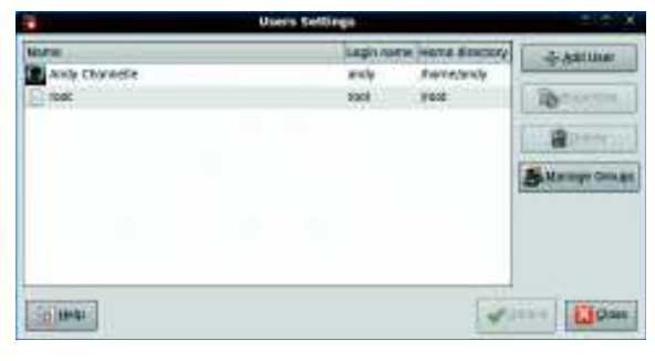
> Go into the User Settings to add and remove users.

about to do anything major. This is great for your system, but