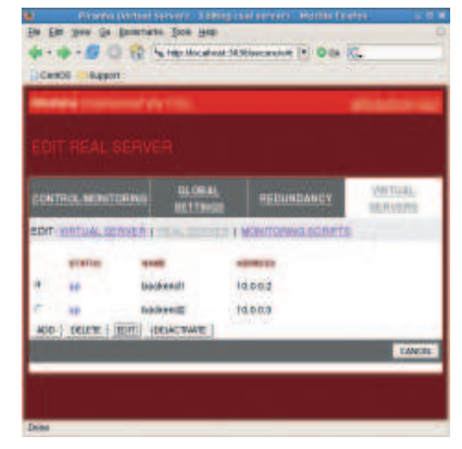
> Figure 3: Specifying the real (backend) servers.

Give the machines static IP addresses appropriate for the internal network. In my case I used 10.0.0.2 and 10.0.0.3 . Set the default route on these machines to be the private IP address of the director ( 10.0.0.1 ).